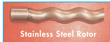
Stainless Steel Rotor